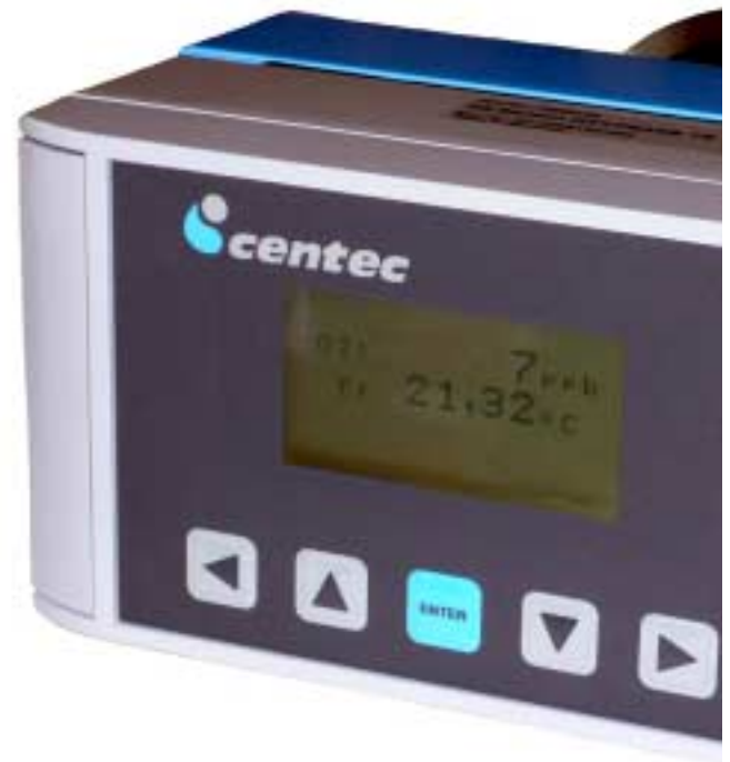
Centec OXYTRANS-TR Optical Inline Oxygen Measurement